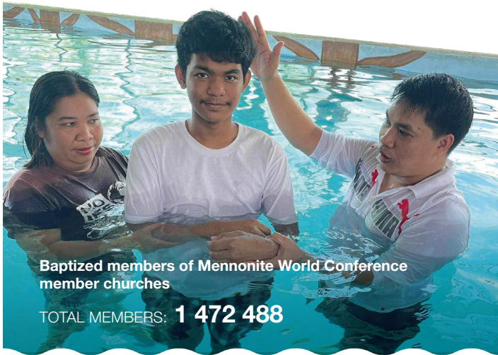
Baptized members of Mennonite World Conference member churches