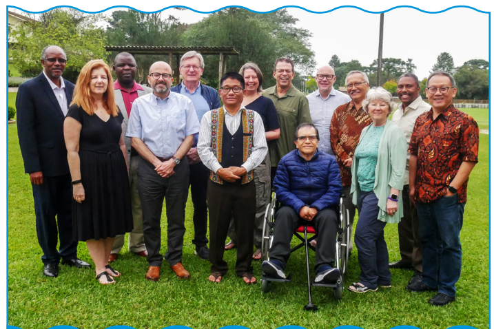
MWC's Executive Committee at annual meetings:

Together, in this Anabaptist stream of Christ's church, we are building peace .