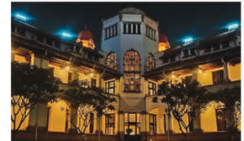
Lawang Sewu colonial building in Semarang

Before and after Assembly Gathered; various locations in Indonesia, Assembly Scattered will provide the opportunity for participants to visit MWC-related congregations throughout Indonesia. Being the oldest Mennonite community outside of Europe and North America, the MWC-related congregations of Indonesia offer an amazing perspective of the history of the Mennonite church in Indonesia, as well as a glimpse of the churches that are shaping its future.