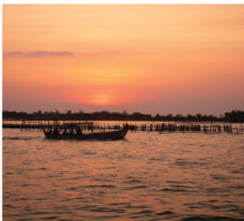
Semarang Marina

Latest Update on Assembly On-site MWC Assembly in Indonesia is welcoming 700 on-site participants with the option of additional Indonesian guests at the opening and closing services based on local government guidelines.