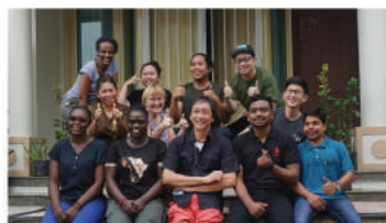
Staff, Volunteers, and YAMENers arriving in Semarang