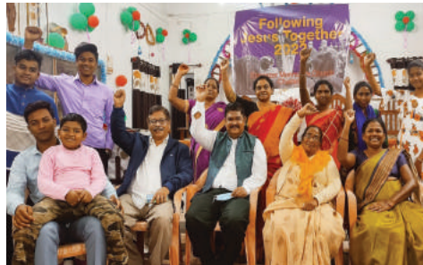
Mennonite Church Charam, India.