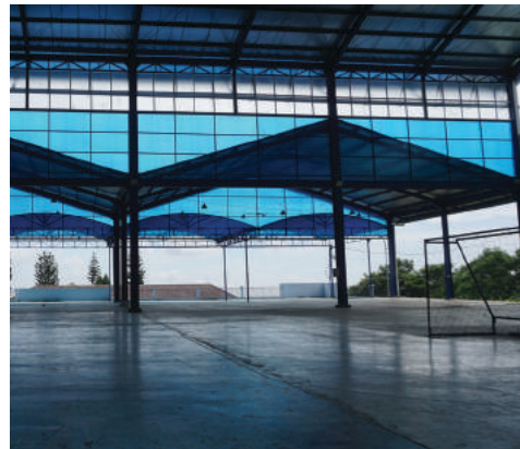
Sangkakala Seminary (STT)

Mennonite World Conference's Assembly, which normally gathers thousands of Anabaptists from around the globe every six years, was postponed from 2021 to 2022 due to the pandemic.