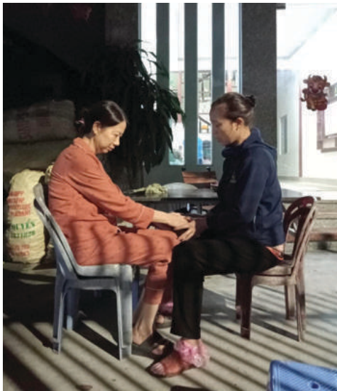
A Mennonite evangelist prays with a community member in Quang Ninh, Vietnam.