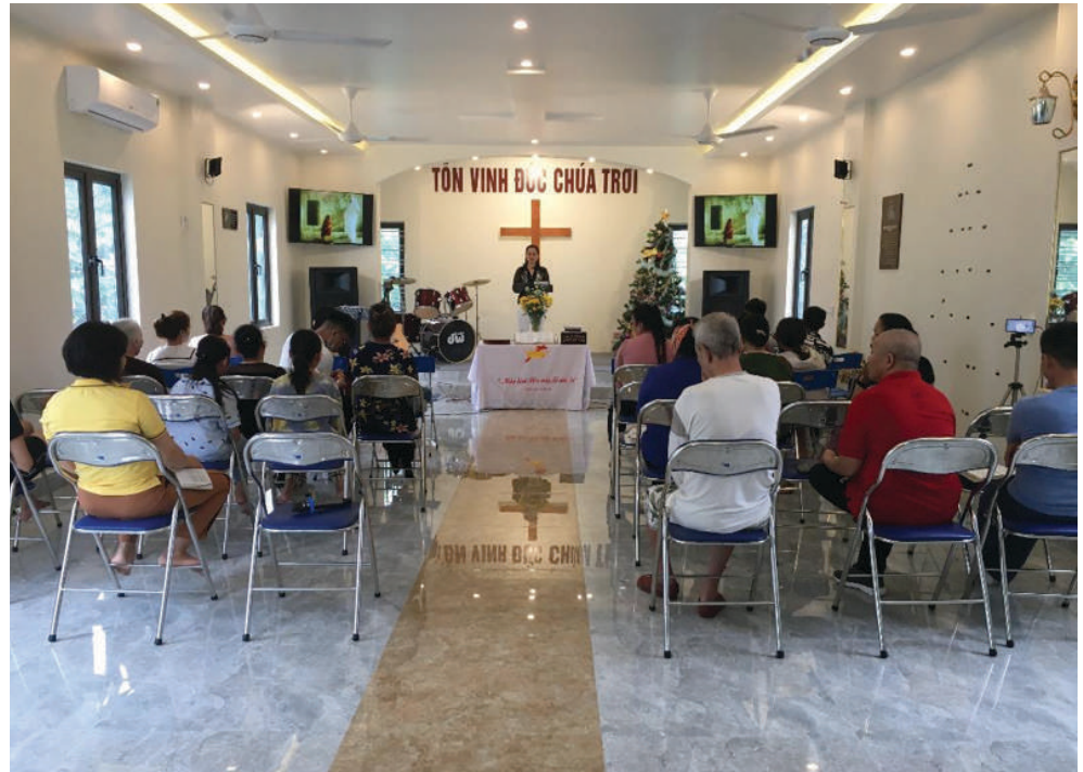
A Mennonite church service in Hai Phong, Vietnam.

In the Central and Southern parts of the country, there are nine organized mission teams of Mennonite church members who go out on mission every month.