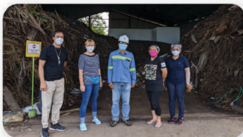
PT AL TSA Composting