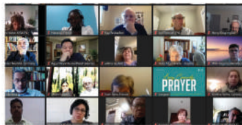
MWC Workshops

For more information and updates, please visit the website .