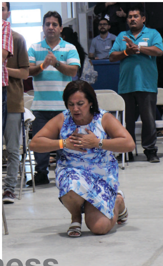
Costa Rica, 2019