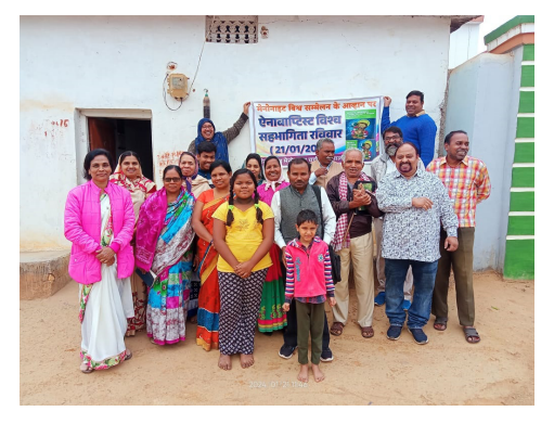
Antakiya Mennonite Church Kodopali, India.

From Antakiya Mennonite Church in rural Kodopali, India, to Iglesia Hermanos Menonitas Concordia in bustling Asuncion, Paraguay to the open-walled gathering place of the Mennonite Church in Ntale, Uganda, to congregations in North America and Europe with generations-long followers of Jesus, Anabaptist-Mennonites celebrated becoming part of God's bigger picture this Anabaptist World Fellowship Sunday.