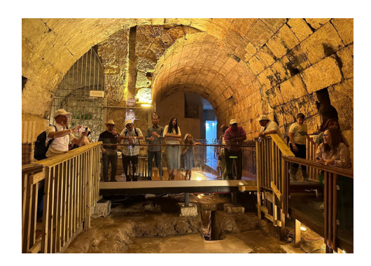
The underground tunnel of the Western Wall in Jerusalem.