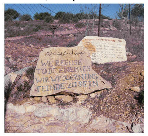
Boundary stone of Tent of Nations. Read more on page 8.

"State violence does not protect me: relationship protects me. We can have safety and space in a shared world," she says.