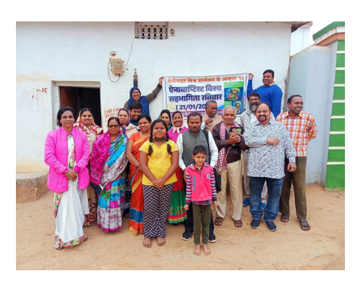
Antakiya Mennonite Church Kodopali, India.

From Antakiya Mennonite Church in rural Kodopali, India, to Iglesia Hermanos Menonitas Concordia in bustling Asuncion, Paraguay to the open-walled gathering place of the Mennonite Church in Ntale, Uganda, to congregations in North America and Europe with generations-long followers of Jesus, Anabaptist-Mennonites celebrated becoming part of God's bigger picture this Anabaptist World Fellowship Sunday.