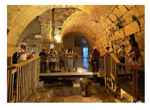
The underground tunnel of the Western Wall in Jerusalem.