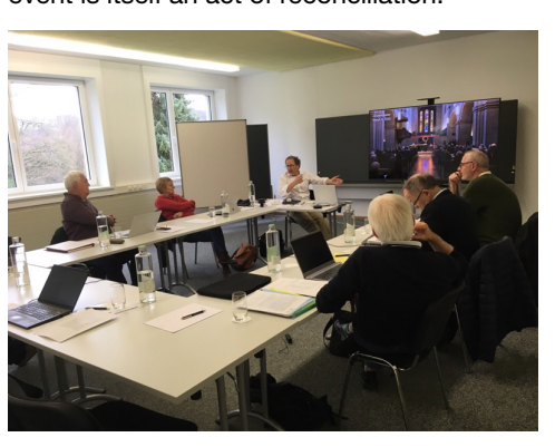
Members of the planning committee for The courage to love meet in Bienenberg, Switzerland, to work on the event.

known for the peace-making work of Mennonite Central Committee and other organizations. But the planning of this event is itself an act of reconciliation.