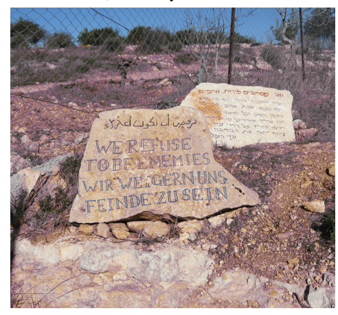
Boundary stone of Tent of Nations. Read more on page 8.

"State violence does not protect me: relationship protects me. We can have safety and space in a shared world," she says.