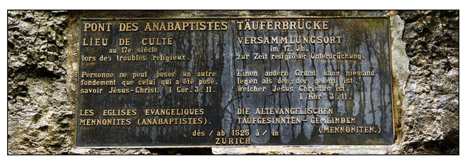
A marker stone identifies the "Anabaptist bridge" in Zurich, Switzerland.

Anabaptist World Fellowship Sunday is an annual event for MWC member congregations around the world, worshipping together in spirit using the same worship resources, knowing that we belong to each other in this global family of faith.