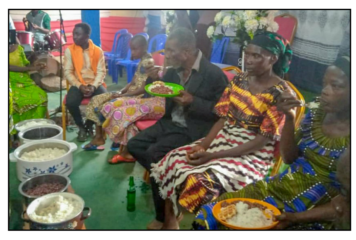
Anabaptist World Fellowship Sunday celebration at Paroisse Missionnaire Shalom de Bukavu in DR Congo.

together before or after worship on Anabaptist World Fellowship Sunday.