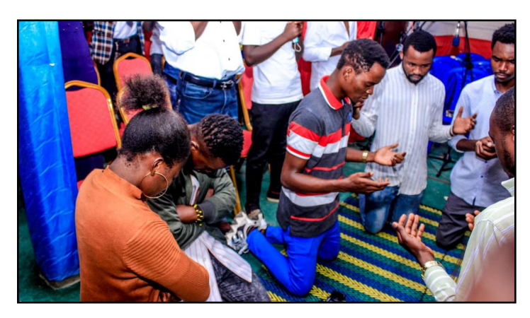
A service of thanksgiving for graduates at Paroisse Missionaire Shalom de Bukavu in DR Congo.

without having seen him. This man said to himself that the day when Jesus would pass by him, he would not miss the opportunity to challenge him. His hope was in Jesus.