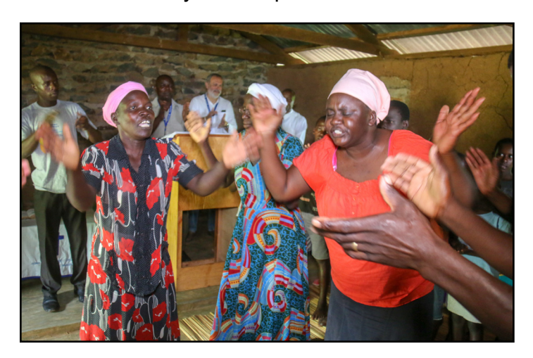
Women dance in worship in Kisumu, Kenya, in 2018.