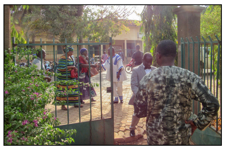
Church members greet each other after a service in Burkina Faso in 2020.