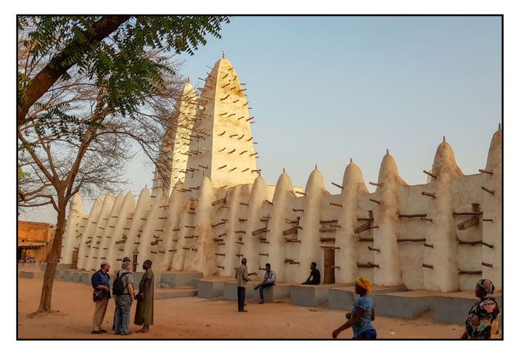
A mosque in Burkina Faso.

Jesus is our hope: even if we go through the valley of the shadow of death, he is by our side.