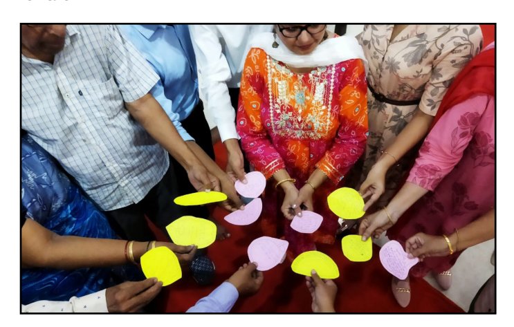
At Hastings Chapel, Kolkata, India (a Bharatiya Jukta Christo Prachar Mandli congregation), members share "fruits" on which they have written how the church is an expression of hope in the midst of external turmoil.

On many occasions, there are different perceptions as to how that witness should be embodied and what it implies in different contexts. And yet, in deciding to walk together as followers of Jesus, there is a commitment and willingness to deal with tensions and conflicts in ways that are consistent with God's shalom.