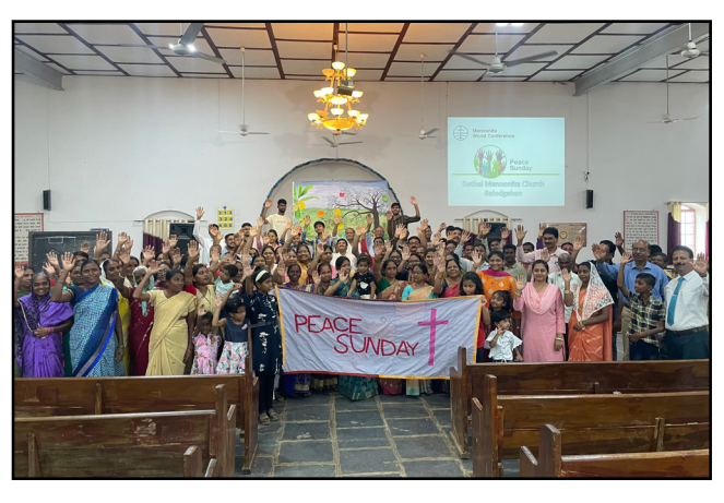
Bethel Mennonite Church in Balodgahan, India celebrates Peace Sunday 2022.

With permission, send your story and photo to <a href="mailto:photo@mwc-cmm.org">photo@mwc-cmm.org</a> to share with the global Anabaptist family.