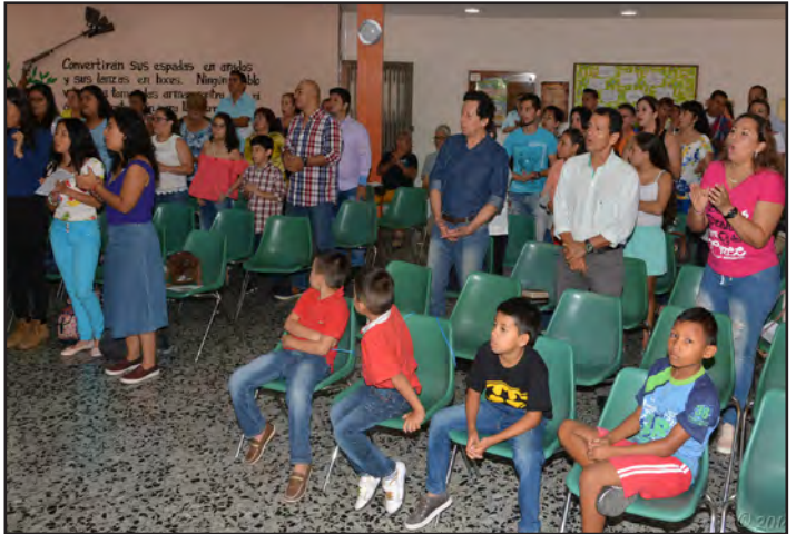
Celebrating World Fellowship Sunday 2018 at Ibagué Mennonite Church in Colombia.

All: Forgive us, Lord, for the times we have not stood on the side of your justice and truth on behalf of the exiled and the outcasts.