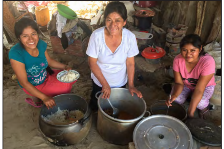
Members of Conferencia Peruana Hermanos Menonitas cook a meal for a church event.