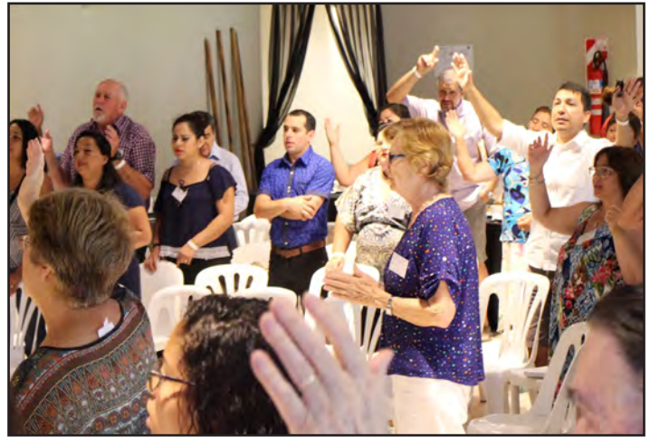
Singing and worshipping together at the 2017 Cono Sur (Southern Cone) gathering of Mennonite churches in South America.

How have you as a church helped each other in this?