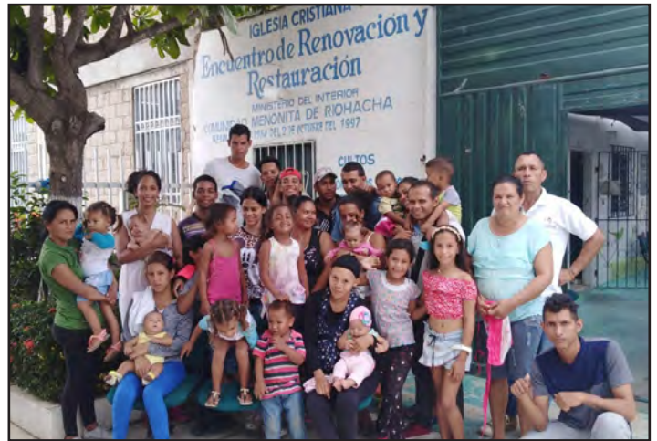
Venezuelan migrants welcomed to the Iglesia Menonita de Riohacha, Colombia.

There we acquired a farm, house, agricultural machinery and vehicles, and with my wife and four small sons, we lived from my law practice, agriculture and journalism. We supported the social and grassroots work of the peasants in the region.