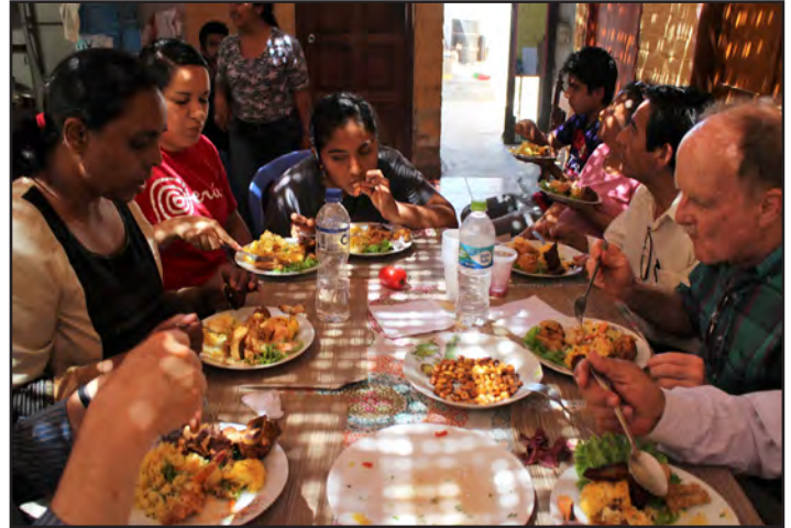
The MWC Deacons delegation shares a meal with members of Conferencia Peruana Hermanos Menonitas.

“Home,” poem by Warsan Shire http://www.care.org/sites/default/files/lesson_1_home-poem-by-warsan-shire.pdf (accessed 30 July 2018) (English)