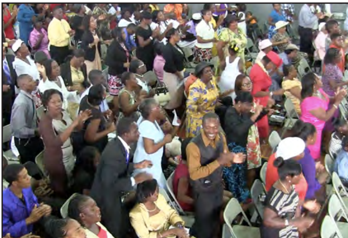
The gathered congregations worship with exuberance at the Jamaica Mennonite Church annual conference.