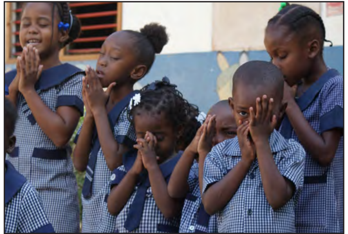
Children from Faith Mennonite Church, Spanish Town, Jamaica, participate in morning prayers to begin their day at the Church Preschool.

Luke 4:18–21. Many theologians identify the book of Luke as the Gospel that spells out the “preferential option for the poor.” The message is directed towards vulnerable groups, establishing their dignity, freeing them, including them in God’s ministry to the world. (See the first three chapters of Luke. There, the shepherds, Joseph, Mary as a pregnant unmarried woman, and two