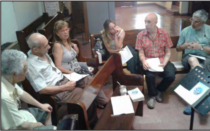
Iglesia Anabautista Menonita de Buenos Aires in Argentina celebrating World Fellowship Sunday 2018.

homeland, the poor, those who have no one to count on other than a community of faith. In this sense, in 1 Peter 2:9–10, the condition of rootlessness is dignified through loving titles such as: a chosen race, a royal priesthood, a holy nation, God’s own people. These phrases proclaim the mighty acts of him who called people out of darkness into his marvellous light. On the one hand, this is a text about the unique family of God, living under the lordship of one King, regardless of condition or nationality or geography. At the same time, this is a text that honours the status of being displaced, persecuted and humiliated. These people are the children of God, his priests, people who belong to another nation, another kingdom, a state that trumps any geopolitical, social or cultural status. Yet in spite of this honouring, they should not forget that they are foreigners, pilgrims “passing through this world” (verses 11 and 12). In other words, they are defenseless and abandon themselves to the Lord for the great work of reconciliation. They have broken with idolatry to the empire and they wait upon the Lord who is full of good works.