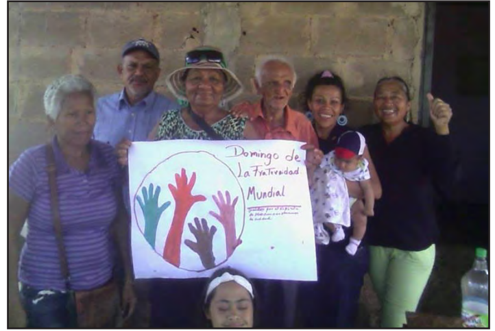
Celebrating World Fellowship Sunday 2018 in Venezuela.

Luke 4:18–21 and 1 Peter 2:9–10 deepen our understanding of what it means to welcome and love the sojourner and foreigner in our midst. In the example of Jesus, it means “to bring good news to the poor. to proclaim release to the captives and recovery of sight to the blind, to let the oppressed go free, and to proclaim the year of the Lord’s favour.” And 1 Peter picks up on this theme, saying that we are called to give witness to the mighty acts of God, calling all people from darkness into God’s marvelous light. Our welcoming love to the sojourner and migrant is an active love, which begins by being sensitive to the needs of the other. Our Anabaptist churches and agencies around the world offer many examples of this active love, sharing the good news of the Gospel, bringing education, health care, trauma healing, development, working for peace, practicing nonviolence and hospitality, development and emergency relief. These acts of love are offered to the strangers and marginalized in our midst and to people in other lands. We can give thanks for these manifestations of the Spirit of the Lord upon us (Luke 4:18) and affirm our calling to witness to God’s Spirit at work (1 Peter 2:9).