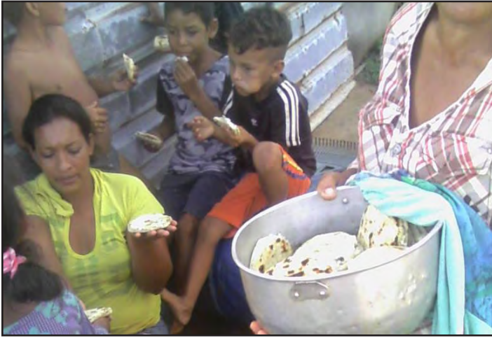
Mennonite Church in Isla Margarita, Venezuela distributing arepas (corn pancakes) to people in an improvised housing settlement.