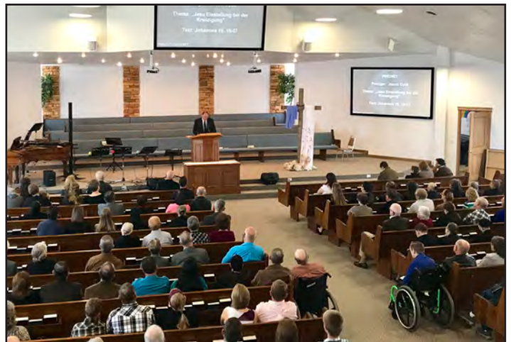
A worship service of a congregation of Conferencia Menonita de México.