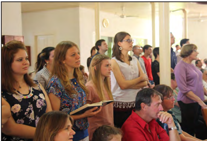
A worship service at MBG Filadelfia, part of Vereinigung der Mennoniten Brüder Gemeinden Paraguays.