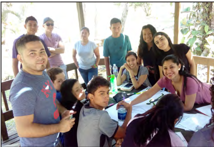
Young Anabaptists participate in a workshop at the 2017 JUAMCA (Juventud Anabautista Menonita Centro Americana – Central American Mennonite youth conference) event.