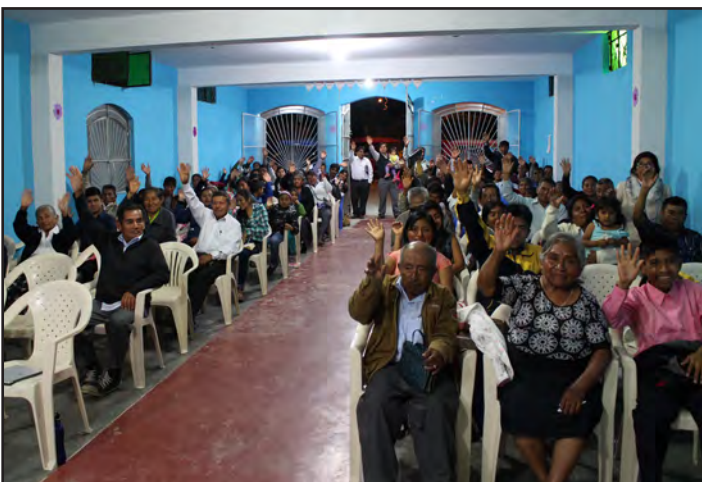
Church members of the Chato Chico congregation in Peru send greetings to Mennonite World Conference.

1 Peter 2:11–12. Peter’s letters were written while always keeping displaced people in mind: the brothers and sisters of the diaspora of the early church, those who have lost their