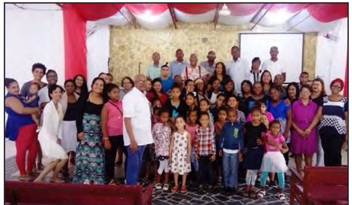
Members of Conferencia Evangélica Mennonita, Inc. in Dominican Republic send greetings to MWC.

*A Lampedusa is a cross made from the wood of refugee boats washed up on the shores of an Italian island in the Mediterranean Sea, first made by Francesco Tuccio as a show of solidarity with refugees fleeing Eritrea and Somalia and which he offered to survivors as a symbol of hope ( https://cafod.org.uk/News/International-news/Lampedusa-crosses-refugees ).