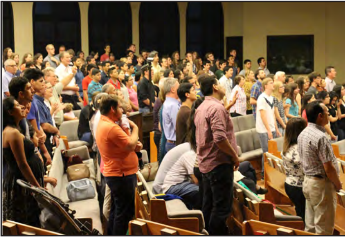
Worship service at MBG Concordia, part of Vereinigung der Mennoniten Brüder Gemeinden Paraguays.

to the city of Quito, Ecuador, which receives hundreds of Colombians who flee the country seeking refuge.