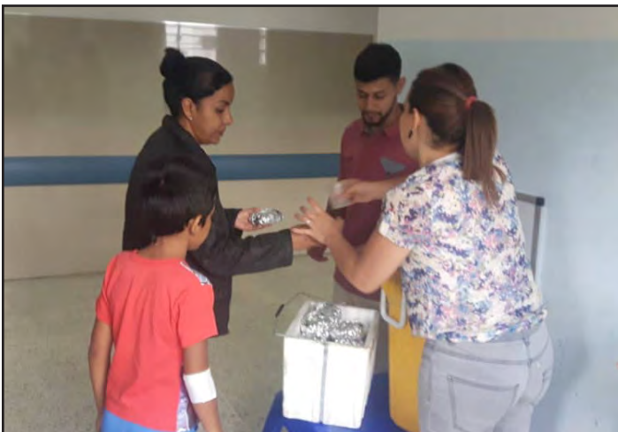
Volunteers from the Mennonite Church in Caracas, Venezuela, distributing food at a hospital.

— Venezuelan migrants welcomed to the Iglesia Menonita de Riohacha, Colombia