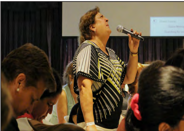
A time of prayer at the 2017 Cono Sur (Southern Cone) gathering of Mennonite churches in South America.