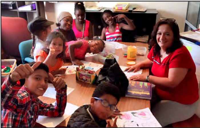
The Quito Mennonite Church Project with Refugee People offers workshops on peace education and values that are directed towards refugee and Ecuadorian children.