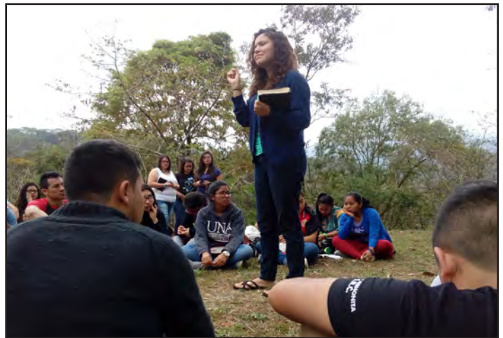
Young Anabaptists participate in a workshop at the 2017 JUAMCA (Juventud Anabautista Menonita Centro Americana – Central American Mennonite youth conference) event.