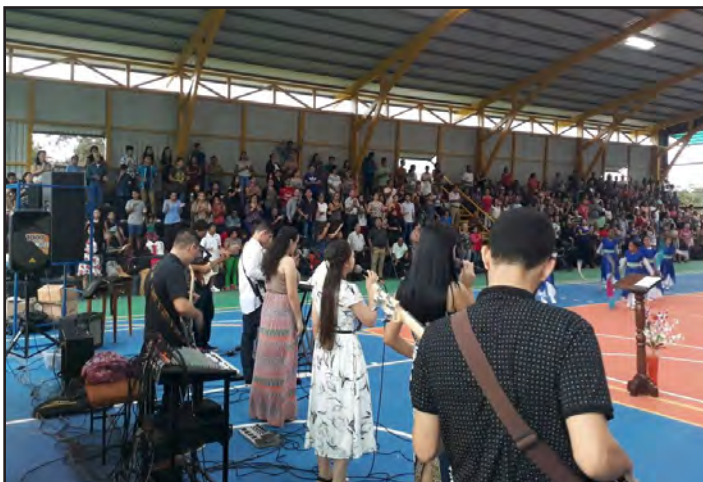
In Costa Rica they celebrated World Fellowship Sunday 2018 with a joint worship service in Sarapiquí.

But it did not end there with the assistance to one family who were members of the church. The concept of inclusive hospitality expanded. No one was excluded and there was always a place for the stranger, the traveller and those who suffer. Inclusive hospitality opened the doors of the church and created an entire ecclesiastical ministry to support hundreds of displaced people who arrived fleeing their lands after losing their belongings and their hope. “The refugee [or displaced person] is the living messenger of misfortune, bringing with him the image, smell and