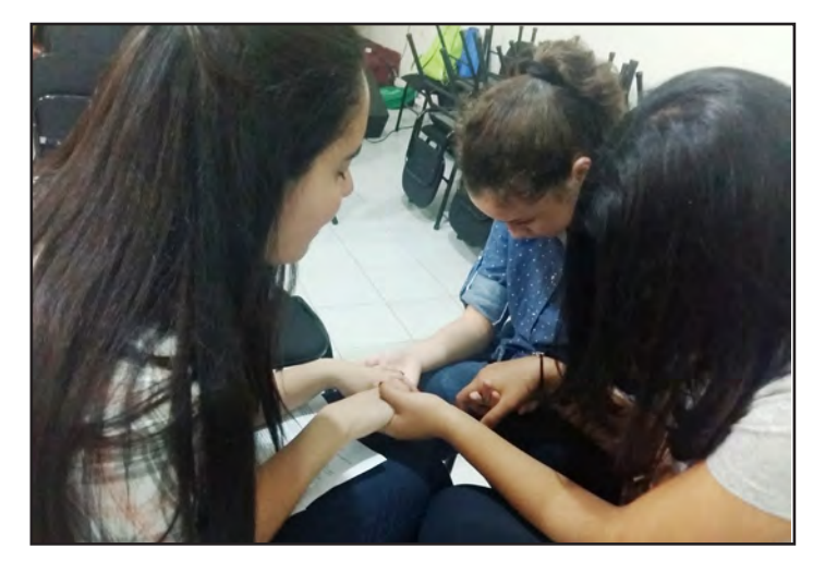
YABs Fellowship Week worship service in Iglesia Maranata de los Hermanos Menonitas, (Mennonite Brethren) Paraguay.

would like to be given things to do, like gardening). My coworker who is also an intern facilitated a workshop on French citizenship, explaining how French institutions work. We shared about how France and their home countries were different. I had the opportunity to share with the women through a cooking workshop.