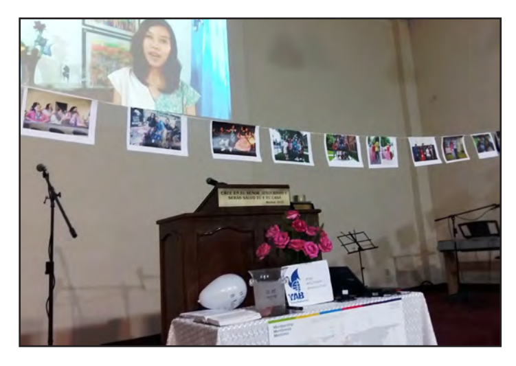
YABs Fellowship Week worship service in Iglesia Maranata de los Hermanos Menonitas, (Mennonite Brethren) Paraguay.

As a country, our nation is among ones participating diplomatically to contribute in peacemaking amongst African and other regional countries. Despite some conflicts within, we value peacemaking in our communities, because we can tell how important being peaceful is. So, when we