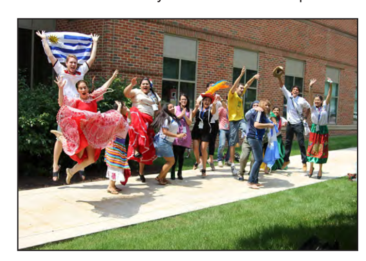
Latin American delegates at Global Youth Summit 2015.

Before I arrived to the Rimlishof, I had a few prejudices against immigrants (for example, that most of them come to take advantage of France). On my first day, I was given documents containing statistics and a book of testimonies of immigrant people in France. The numbers allowed me to get rid of my prejudices. The testimonies moved me. I was shocked to discover the horrors that some people had to go through in their home country or even in the European