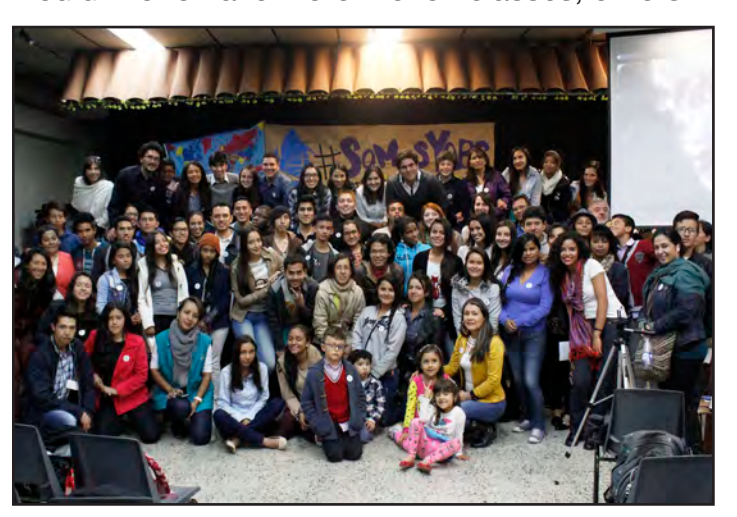
YABs Fellowship Week 2016 joint worship service with Mennonite, Mennonite Brethren and Brethren in Christ participating, in Bogota, Colombia.

I realized that at the end of the day, these refugees are people like us with good qualities and shortcomings, with expectations (some families would like to have more French classes, others